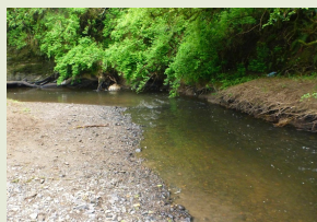
At Tanagh OETC we have chosen ideal locations on local rivers for Geographical Investigations.

We provide tailor made Geography investigations and