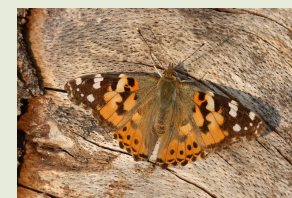
Painted Lady Butterfly in Dartrey Forest